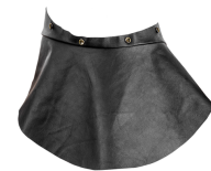
Leather welding bib

Auto-darkening welding filter featuring LiFE+ Color ADF technology that provides greater clarity of vision. Shade adjustments: 5, 8, 9-13 and 14, 15.