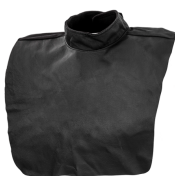
Universal leather neck protector

Optional integrated neck protection for Alfa and Beta e-series models. Snap buttons allow easy removal and attachment.