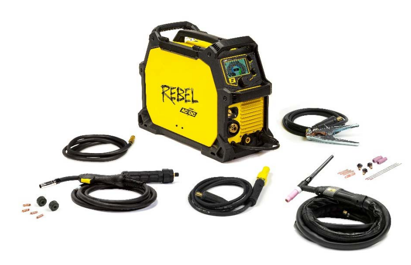
Rebel EMP 205ic AC/DC and accessories.