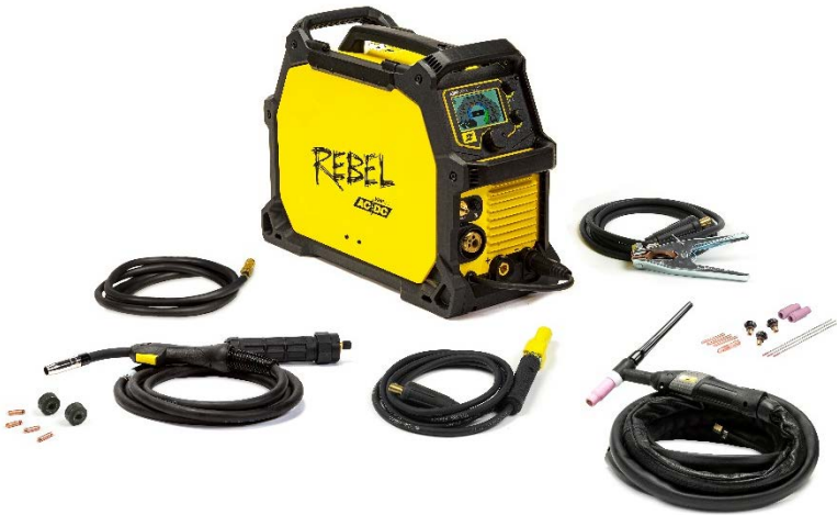
Rebel EMP 205ic AC/DC and accessories.

We made the impossible possible with the first-ever portable, all-process machine, complete with MIG, Flux-Cored, MMA, DC TIG, and now AC TIG capabilities, which means – yes – it TIG welds aluminium. It is a TRUE all-in-one welding system that delivers best-in-class performance in each process in the most portable, durable, go anywhere, weld anything industrial package on the market today.